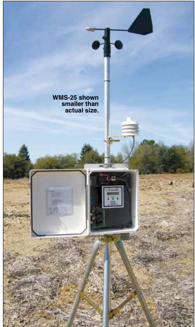
WMS-25 shown smaller than actual size.

Using the recorded data is simple. The SD card is inserted into a card reader attached to the USB port on your computer (Windows, Macintosh, and Linux) and will then show up as a drive. To view and graph the data, click on the file corresponding to the day of interest. Microsoft Excel, OpenOffice.org, or any spreadsheet program can be used to view, graph, and analyze your data.