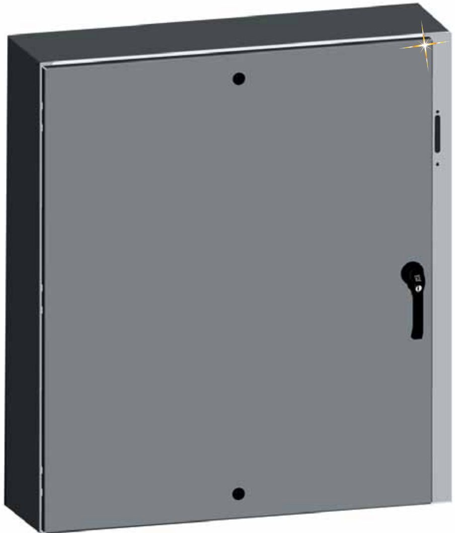
SCE-20XEL2108LP shown smaller than actual size.