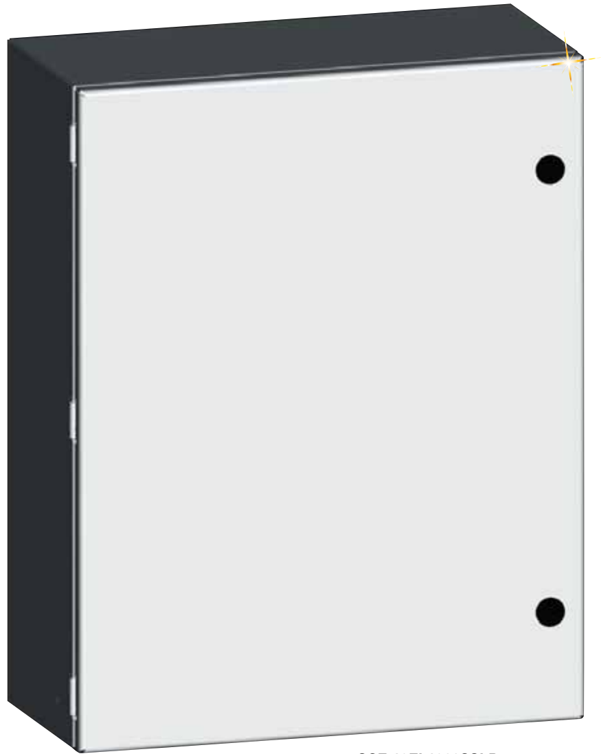
SCE-12EL1206SSLP shown smaller than actual size.