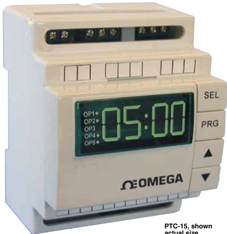
PTC-15, shown actual size.

Simple programming, a large bright LED display, and a standard DIN rail mounting package only 70 mm (2.75") wide make the unit