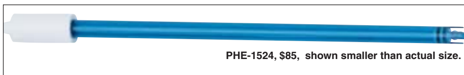
PHE-1524, $85, shown smaller than actual size.

The PHE-1524 is a sealed, polymer-bodied, 254 mm (10") long combination pH electrode. The length allows measurements to be made in large, deep flasks or bottles. This sensor has our full-span pH glass and a gel-filled silver chloride reference using the trouble-free porous PTFE liquid junction.