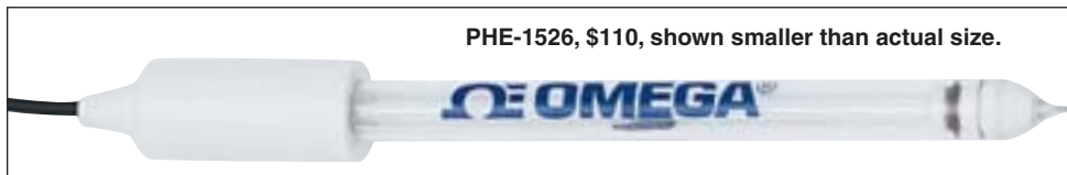
PHE-1526, $110, shown smaller than actual size.

The PHE-1525 flat style is a refillable combination pH electrode with a polymer body, porous PTFE liquid, and a flat pH glass membrane. It can be used to measure the pH of any moist surface or inverted and used as a "one-drop" electrode. Samples as small as 100 µL are easily measured with this inverted technique.