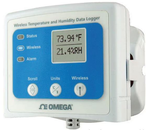
OM-CP-RFRHTEMP2000A with mounting bracket, shown in actual size