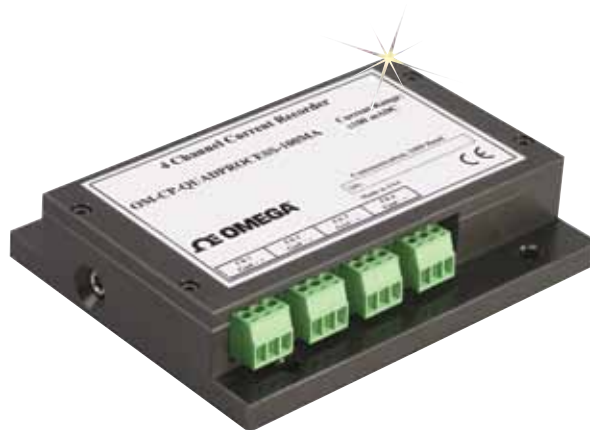
OM-CP-QUADPROCESS-100MA shown smaller than actual size.