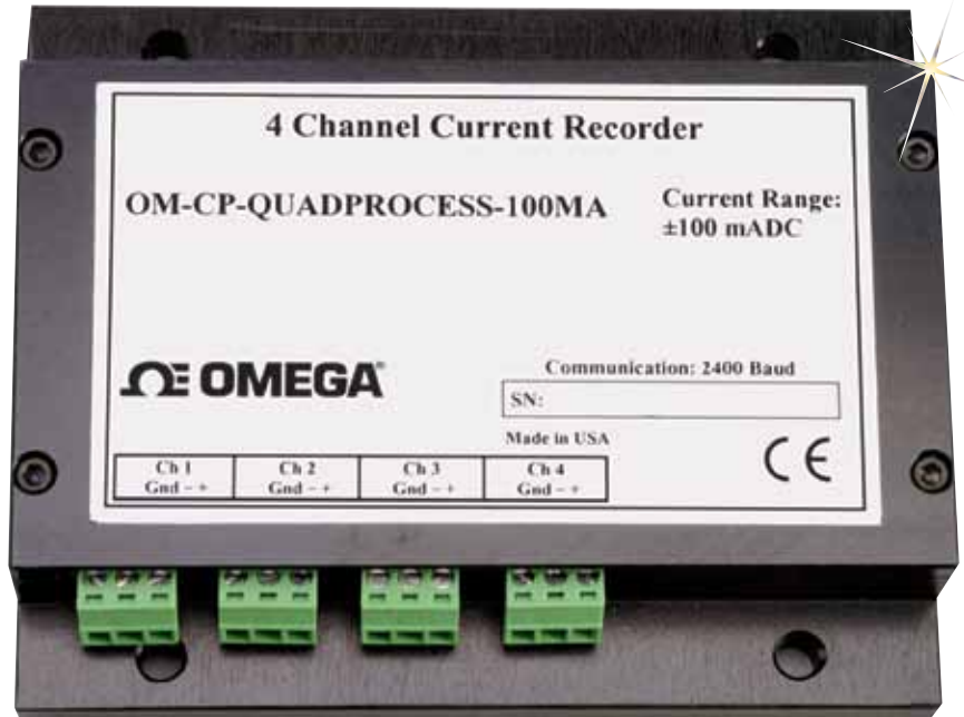
OM-CP-QUADPROCESS-100MA shown actual size.

The software converts a PC into a real-time strip chart recorder. Data can be printed in graphical or tabular format. It can also be exported to a text or Microsoft Excel file.