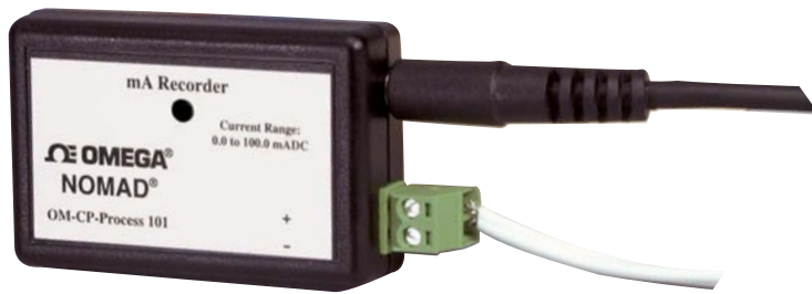
OM-CP-PROCESS110-25MA, $299, data logger shown larger than actual size