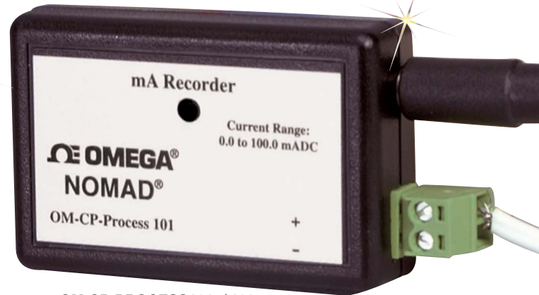
OM-CP-PROCESS101, $199 data logger shown larger than actual size