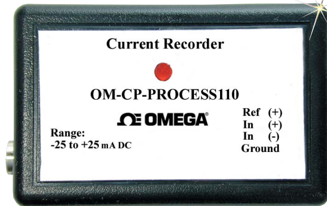
OM-CP-PROCESS110-25MA, $299, data logger shown larger than actual size