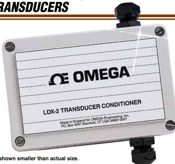
LDX-2, shown smaller than actual size.