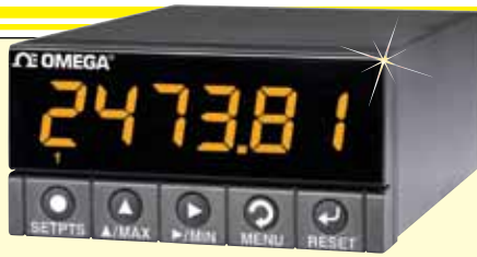
DP41-B shown smaller than actual size.