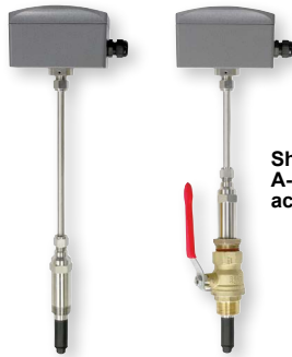
Shown with A-IEF-VLV-BR** accessory valve kit