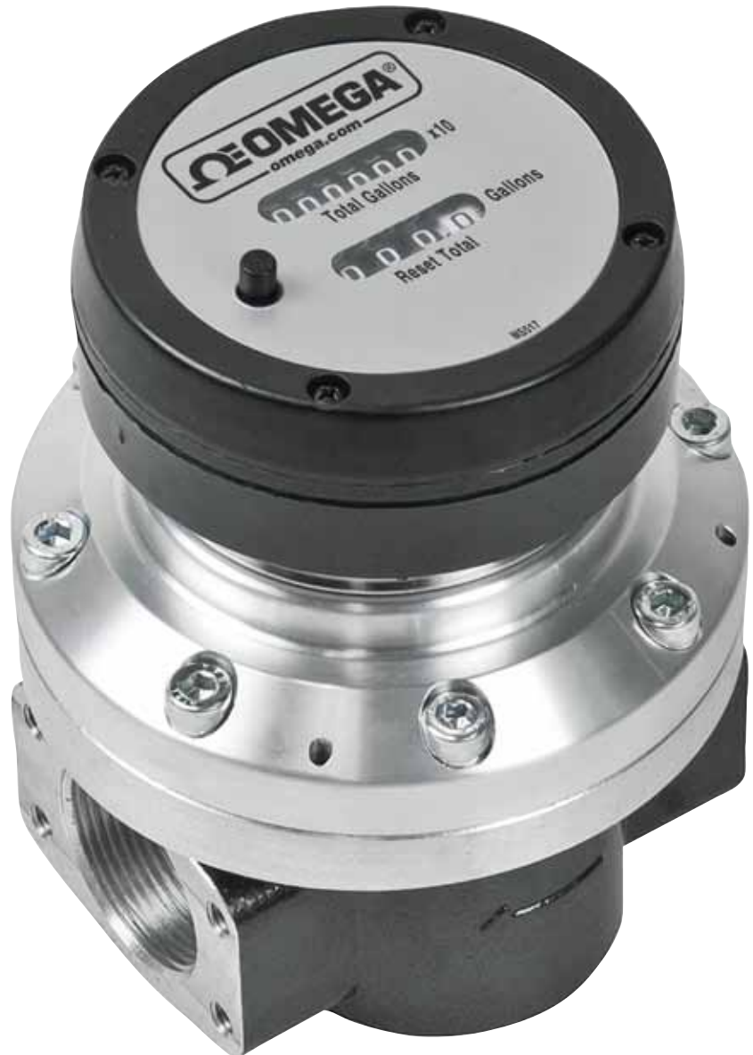
FPDM3004 shown smaller than actual size.

The FPDM3000 Series positive displacement oval gear flow meters are affordable and accurate. One primary feature is the ability to maintain consistent accuracy despite changing viscosity conditions. The meter's solid construction and excellent dynamic response are well suited to the measurement of many viscous fluids. Three choices of wetted material combinations are available for compatibility with a large variety of liquids. Since there is no need for straight run piping upstream or downstream of the flow meter, the FPDM3000 flow meters are simple to use and to install. The meter has good resolution and high accuracy at low flow rates.