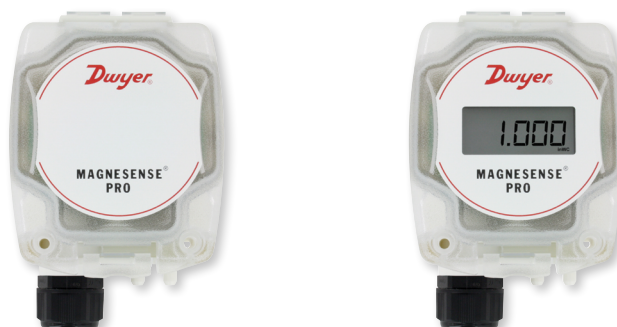
MSX Pro with optional LCD