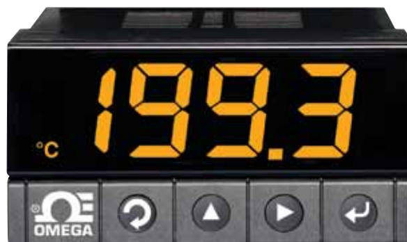
DPI8, shown smaller than actual size.