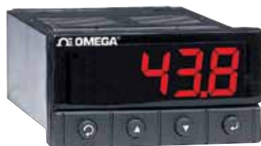
DPI32, shown smaller than actual size.