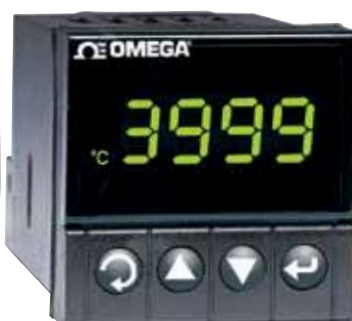
DPI16, shown smaller than actual size.