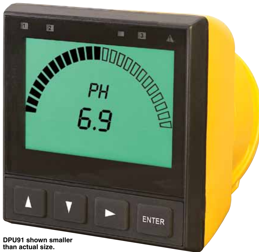
DPU91 shown smaller than actual size.

The DPU91 transmitter provides a single channel interface for many different parameters including flow, pH/ORP, conductivity/resistivity, salinity and temperature. The DPU91-BC transmitter has the added capability of supporting the batch module for batching control. The extra-large (3.90 x 3.90") autosensing backlit display can be viewed at 4 to 5 times the distance over traditional transmitters. The highly illuminated display and large characters reduce the risk of misreading or misinterpreting the displayed values. The display shows separate lines for units, main and secondary measurements as well as a “dial-style” digital bar graph. The DPU91 is offered in both panel or field-mount versions. Both configurations can run on 12 to 32 Vdc power (24 Vdc nominal). Designed for complete flexibility, plug-in modules allow the unit to easily adapt to meet changing customer needs. Optional modules include relay, direct conductivity/resistivity, batch and a PC communications configuration tool. The unit can be used with default values for quick and easy programming or can be customized with labeling, adjustable minimum and maximum dial settings, and unit and decimal measurement choices.