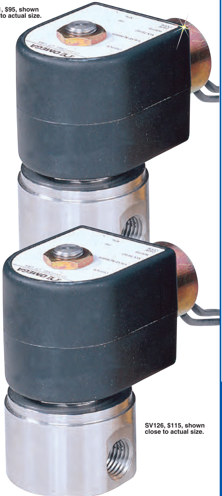
SV126, $115, shown close to actual size.