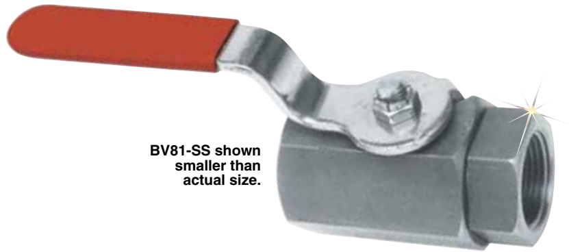
BV81-SS shown smaller than actual size.