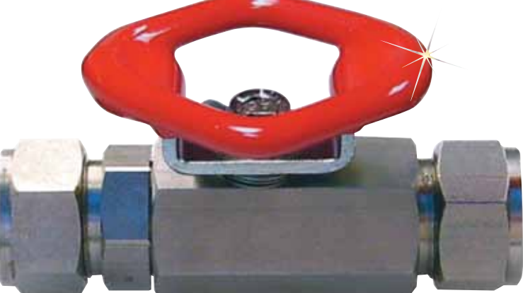
BV71-SS shown larger than actual size.

As with all valve products the BV70 Series utilizes our superior self-compensating stem seal design. This proven design automatically compensates for wear as well as thermal expansion and contraction resulting in a leak tight, maintenance free, service life.