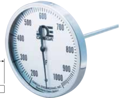
Shown smaller than actual size.

Dual Ranges are Available! Consult Sales for Information.