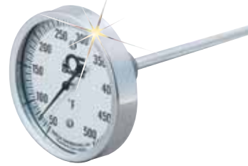
Shown smaller than actual size.