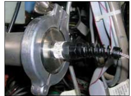
TCV probe shown installed using customer supplied clamp and O-ring.