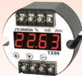
TX86 transmitter with built-in indicator.