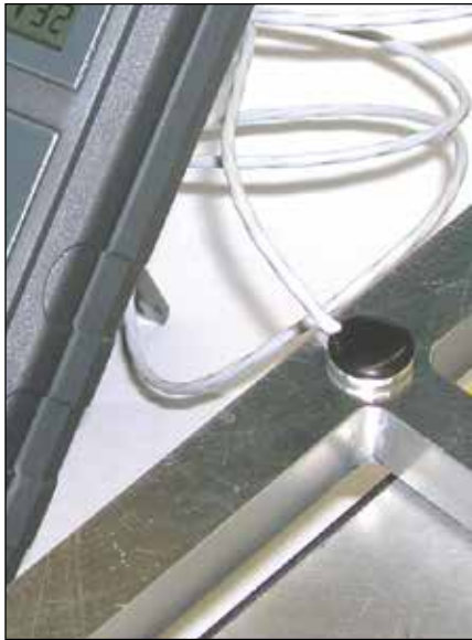
RTD-809 shown smaller than actual size.