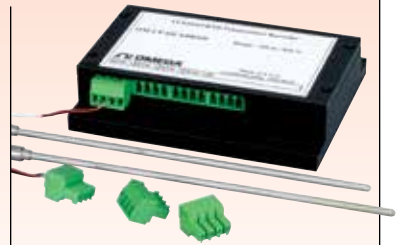
OM-CP-QUADRTD 4-channel data logger.