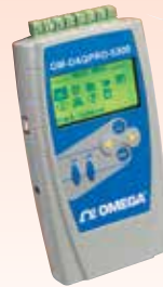
OM-DAQPRO-5300 handheld data logger.