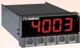
DP25B-RTD process meter/controller.