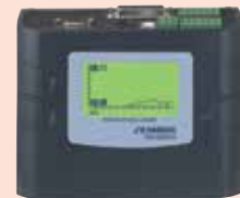
OM-SQ2010 data logger.