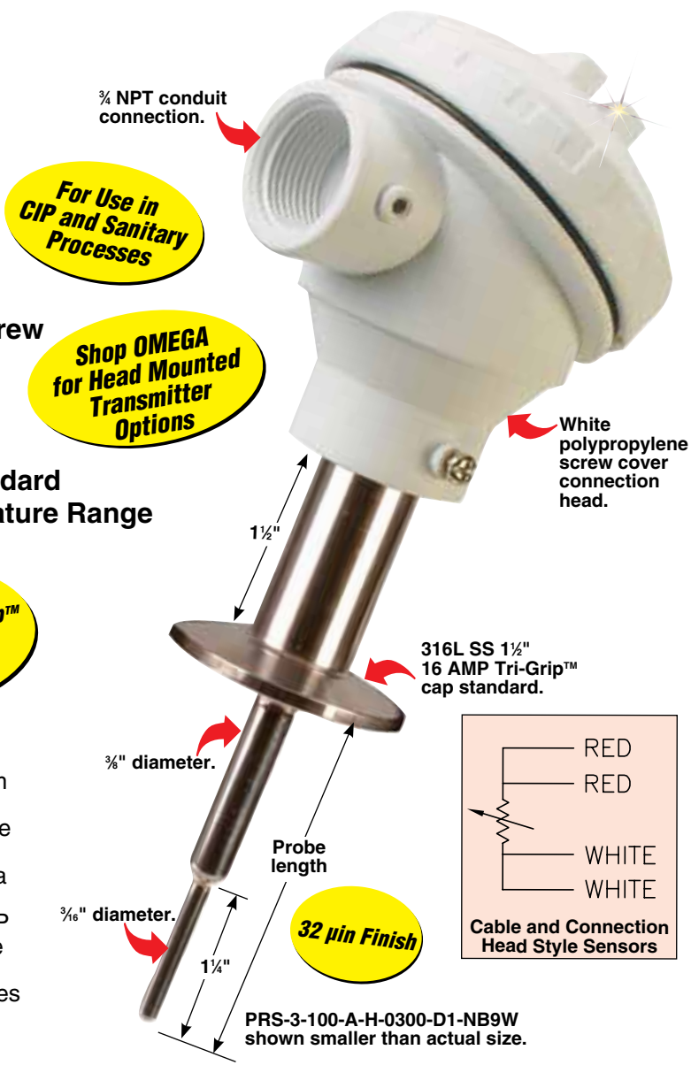
PRS-3-100-A-H-0300-D1-NB9W shown smaller than actual size.

The OMEGA® PRS-H-NB9W Series RTD probe assemblies are available in standard lengths from 3 to 6", with a 4-wire Pt100 Class A element ( 100 \pm 0.06\Omega at 0°C) that is compatible with 3-wire RTD instrumentation. These heavy-duty probes have a ¾" diameter, which steps down to a ⅜" dia at the probe tip, for fast response and additional strength. Standard features include a 1½" 16 AMP Tri-Grip™ fitting, type NB9W white polypropylene protection head with screw cap. Please consult sales for available options, including element types and curves, probe lengths, protection heads and sanitary fitting styles.