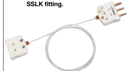
TECU10-MTP extension cable.