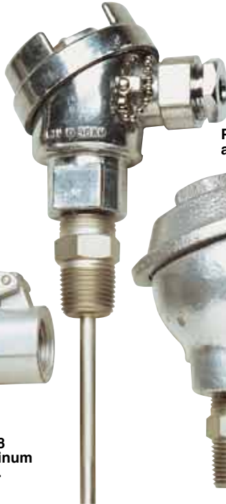
PR-14 miniature aluminum head.

Covered by U.S. and International patents and pending applications