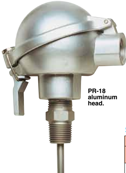
PR-18 aluminum head.