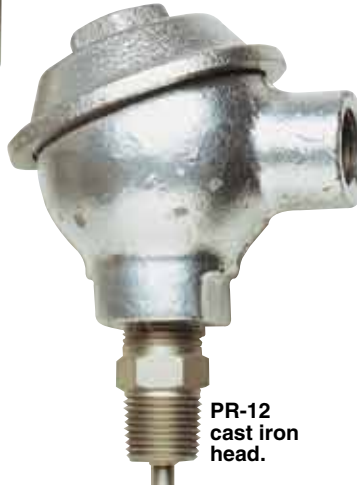
PR-12 cast iron head.