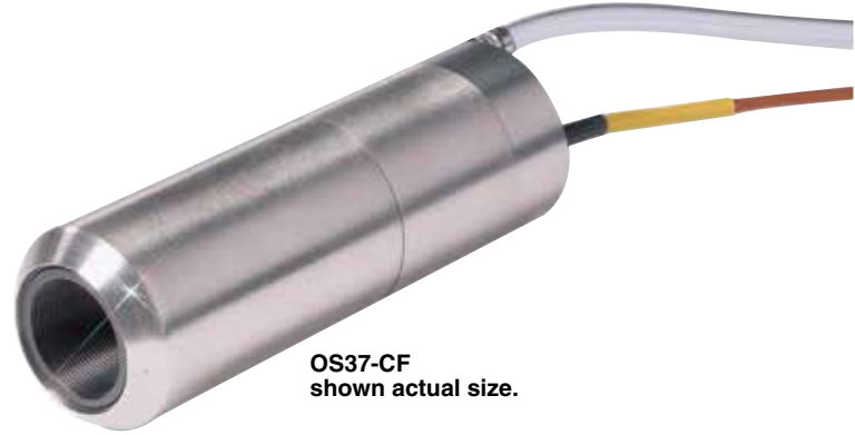
OS37-CF shown actual size.