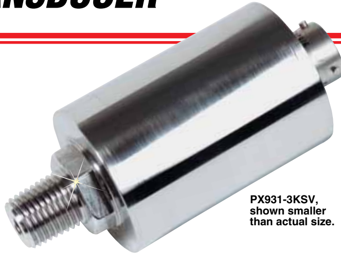
PX931-3KSV, shown smaller than actual size.