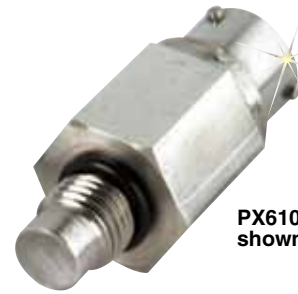
PX610-100GV, shown actual size.

Zero Balance: ±3.0% Operating Temperature Range: -54 to 121°C (-65 to 250°F) Compensated Temperature Range: 16 to 71°C (60 to 160°F) Thermal Zero Effect: ±0.01% FS/°F Thermal Span Effect: 0.036% FS/°C (± 0.02% full scale/°F) max Proof Pressure: 150% range Burst Pressure: The lesser of 400% range or 30,000 psi max Body Material: 17-4 PH stainless steel Diaphragm Material: 17-4 PH stainless steel O-Ring Size: 2-012, polyvinyl