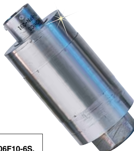
PX35K1-1KGV, shown actual size.