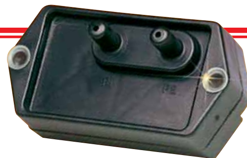
PX142-015D5V, shown actual size.