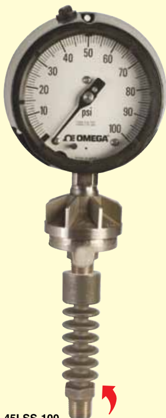
PGR-45LSS-100 shown with PG-CT2 cooling element (sold separately).

For high temperature applications up to 204°C (400°F) use with PG-CT2.