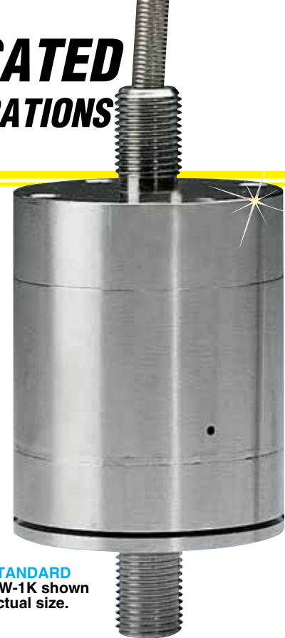
STANDARD LCUW-1K shown actual size.