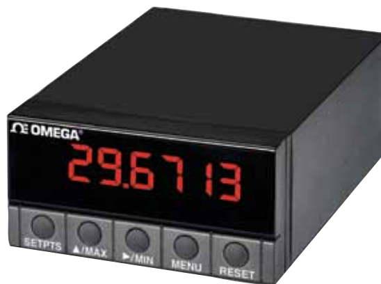
DP41-E, shown smaller than actual size.