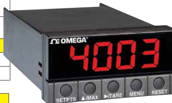
DP25B, shown smaller than actual size.