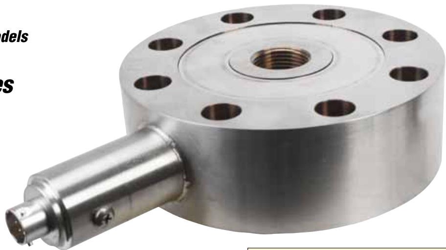
LCHD-7.5K1C2IS, twist-lock termination shown.