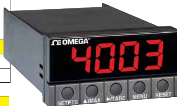
DP25B, shown smaller than actual size.