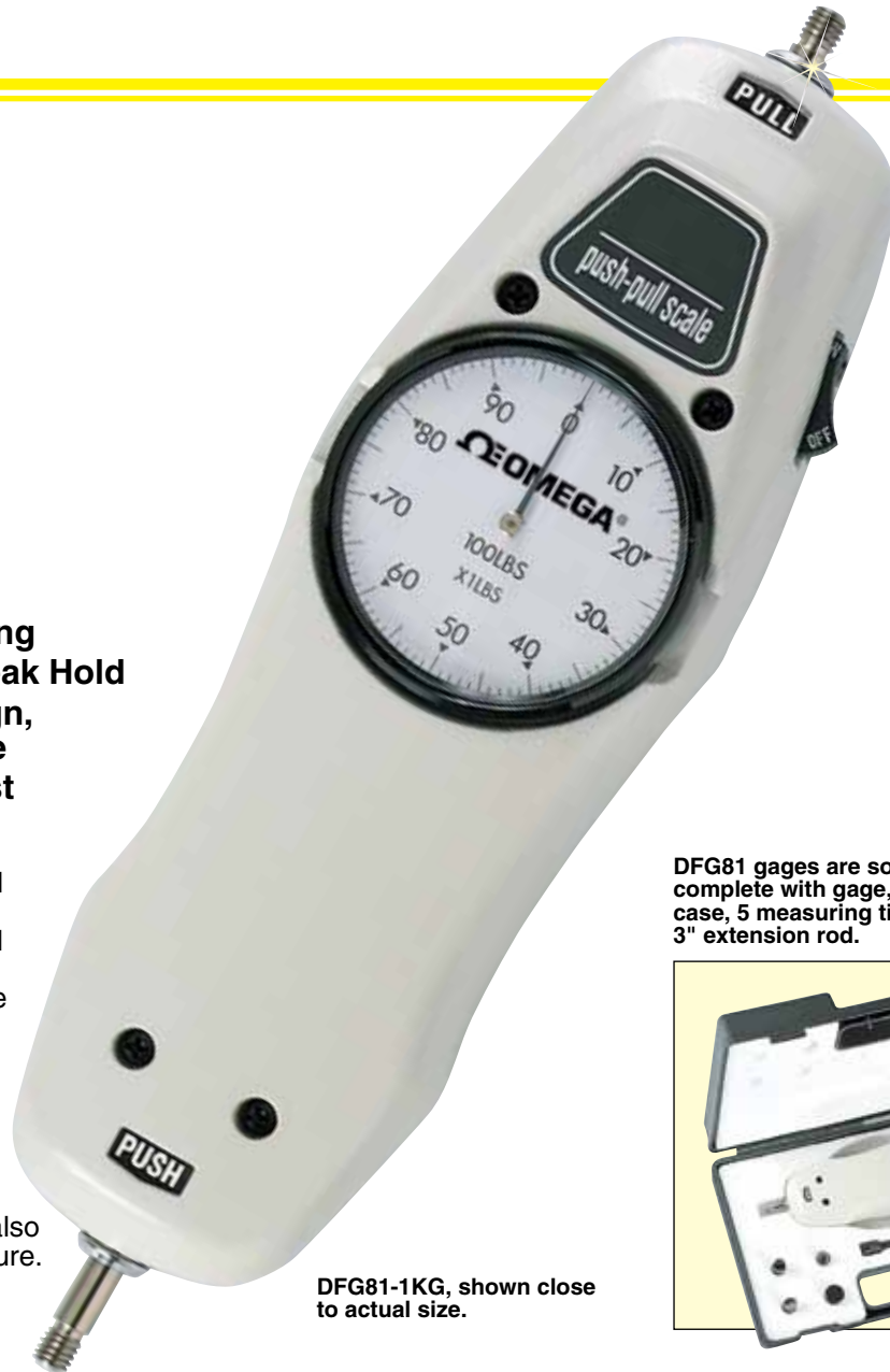
DFG81-1KG, shown close to actual size.

The ruggedly constructed DFG81 gages will withstand harsh industrial environments yet remain accurate to ±0.3%. These gages are sold as kits complete with gage, hard carrying case, 5 measuring tips, and a 3-inch extension rod. The ergonomic design makes the DFG81 ideal for handheld use. It can also be mounted on a test fixture.