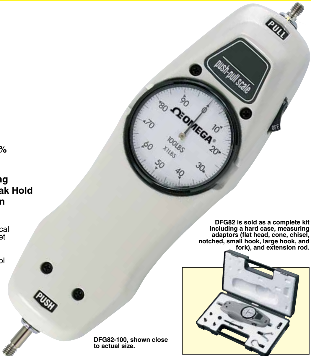
DFG82-100, shown close to actual size.

The DFG82 Series laboratory-grade mechanical force gages are durable yet highly accurate, making them ideal for tension and compression quality control measurements. DFG82 gages are sold in kits, complete with meter, hard case, measuring adaptors (flat head, cone, chisel, notched, small hook, large hook, and fork), and extension rod. The ergonomic design is well suited for handheld testing.