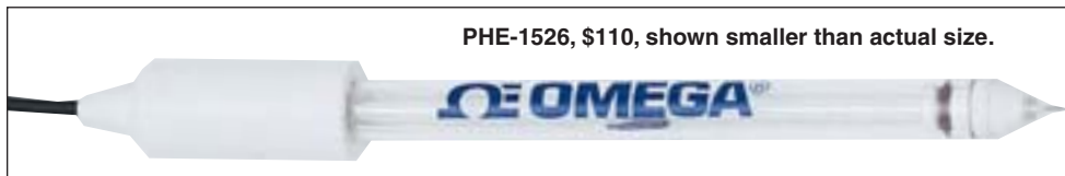
PHE-1526, $110, shown smaller than actual size.

The PHE-1525 flat style is a refillable combination pH electrode with a polymer body, porous PTFE liquid, and a flat pH glass membrane. It can be used to measure the pH of any moist surface or inverted and used as a "one-drop" electrode. Samples as small as 100 µL are easily measured with this inverted technique.