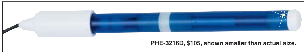
PHE-3216D, $105, shown smaller than actual size.

Laboratory procedures require a separate reference electrode. Several standard methods and techniques for pH measurement and most ion selective electrodes require the use of a "double junction" reference electrode. The PHE-3216 is ideal for such applications. These gel-filled electrodes feature a replaceable porous PTFE liquid junction in a polymer body. They are supplied ready to use with a saturated potassium chloride-silver reference cell. The double junction version uses potassium nitrate as the screening electrolyte, although it can be easily replaced with the electrolyte of your choice. The liquid junction has a large surface area and provides a stable, low-impedance contact to the solution, ensuring fast, accurate measurements. The chemically inert nature of PTFE makes the sensor easy to clean.