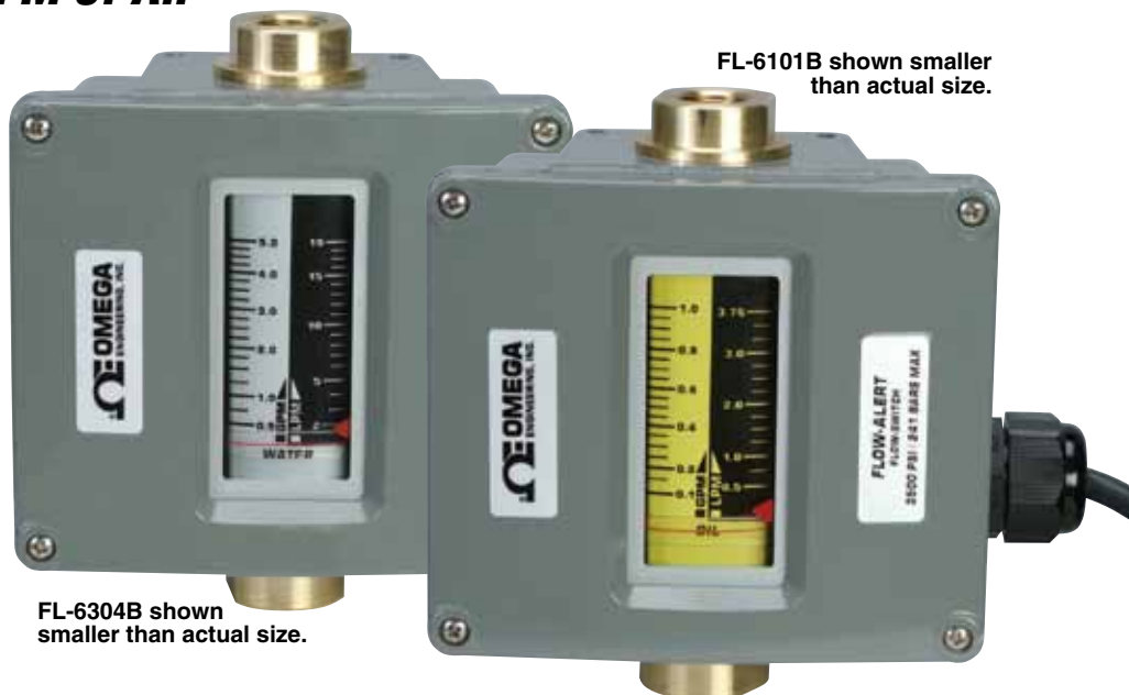
FL-6101B shown smaller than actual size.

OMEGA® in-line flow meters offer high accuracy flow rate indication for water, oil, or air and the ability to either control the flow rate or alarm on high or low flowrates. These units feature an SPDT switch that can be triggered at any point along the flow range.