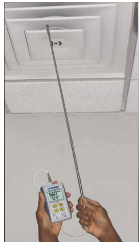
Measuring air flow from an air conditioning duct.