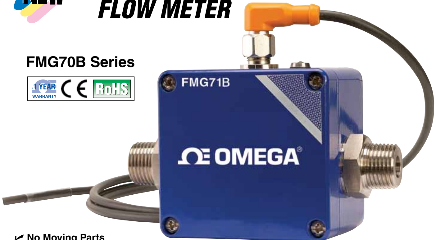
FMG71B shown actual size.