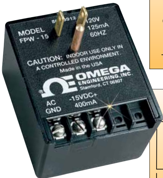
FPW-15 shown smaller than actual size.

The FPW-15 is a regulated 15 Vdc supply for electronic equipment.