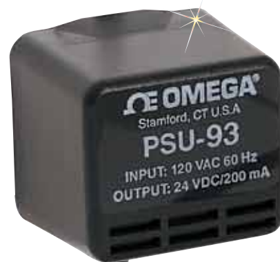
PSU-93 shown smaller than actual size.

PSU-93 plug-in power supply provides an unregulated 16 to 23V supply for electronic equipment.