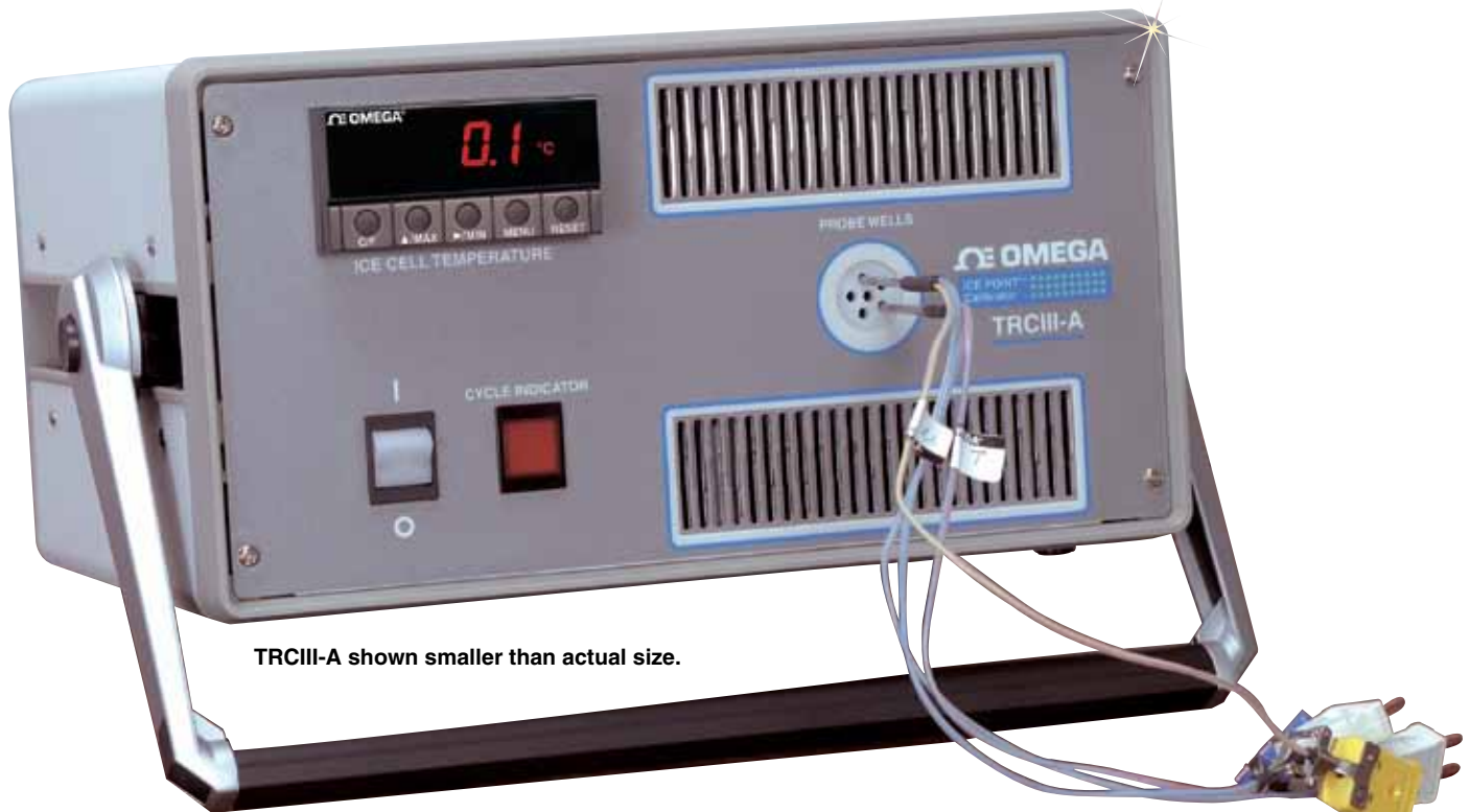
TRCIII-A shown smaller than actual size.