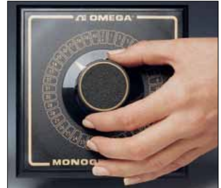
MONOGRAM® SERIES with gold plated contacts

Two pole SW and OSW series switches have a convenient "off" position. The "off" position may be left as an open circuit or shorted to keep spurious signals from registering on thermocouple instruments. Each pole is fully isolated. For quick and easy wiring, the terminals located at the rear of the switch are clearly marked.