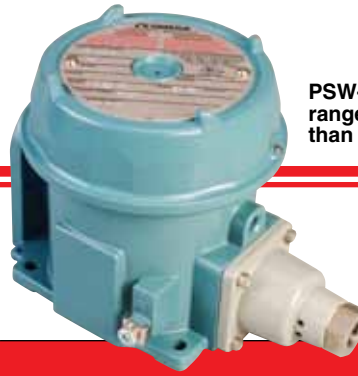
PSW-707, 0 to 500 psi range, shown smaller than actual size