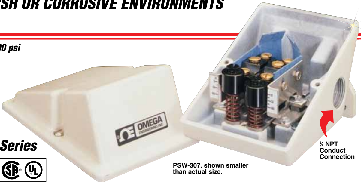
PSW-307, shown smaller than actual size.

Differential Pressure Models Available Visit Us Online