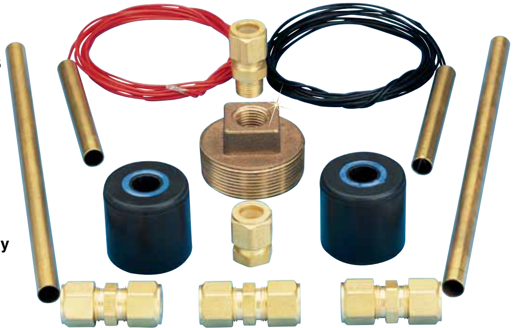
LV-120 complete drum indicator kit, shown smaller than actual size.

The LV-120 Series OMEGA LEVEL custom switch kits can be assembled and installed vertically in your tank in minutes. Each kit contains all the components for complete assembly of a 1- or 2-station level switch for pipe-plug mounting. Additional level stations may be added (see accessories).