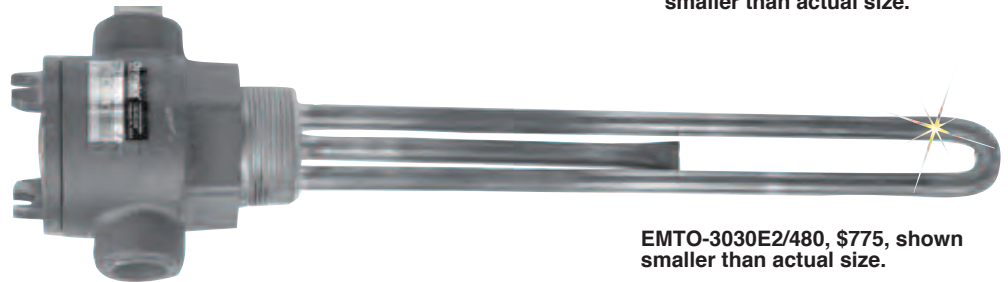
EMTO-3030E2/480, $775, shown smaller than actual size.