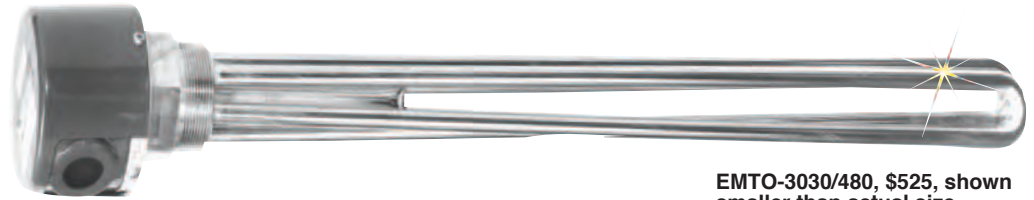
EMTO-3030/480, $525, shown smaller than actual size.