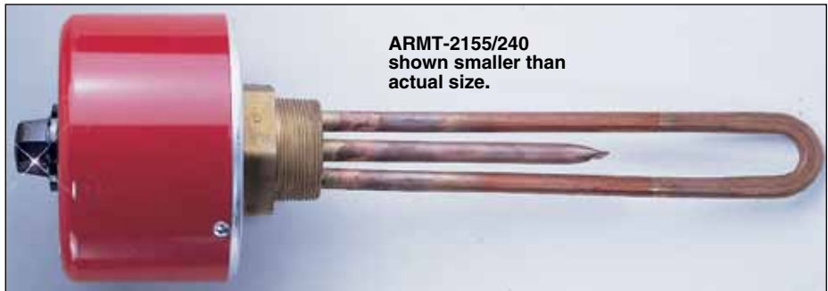
ARMT-2155/240 shown smaller than actual size.

Fire and electrical shock may result if products are used improperly or installed or used by non-qualified personnel. See inside back cover for additional warning.