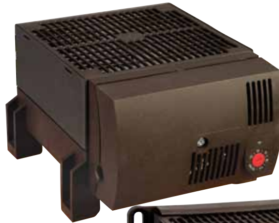
CR030599 shown smaller than actual size.