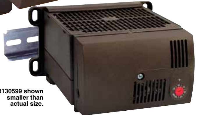
CR130599 shown smaller than actual size.