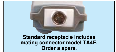
Standard receptacle includes mating connector model TA4F. Order a spare.

condition to a remote host, such as the UWTC-REC Series. You can program the UWRTD to transmit your data at intervals from every 2 seconds to every 2 minutes. Data received by the UWTC-REC can be received and displayed on your computer, using the TC Central software included with each unit. TC Central software can turn your PC into a strip chart recorder or data logger so readings can be saved and later printed or exported to a spreadsheet file.