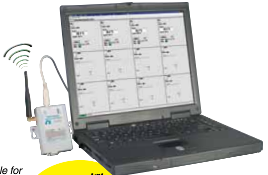
Laptop not included.