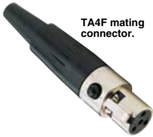
TA4F mating connector.

For (Pt100) Sensors—The Smart Connector™