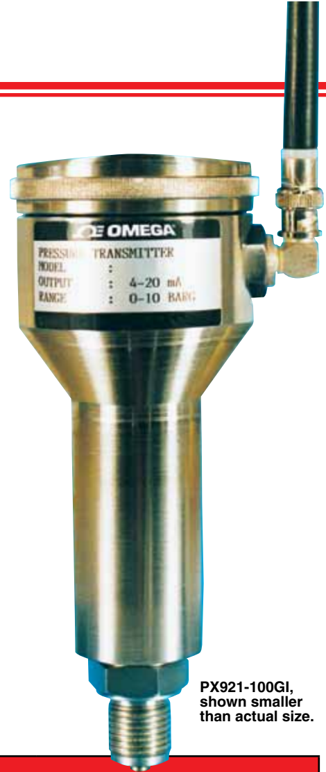
PX921-100GI, shown smaller than actual size.

SOS construction uses very stable solid state silicon strain gages on a Sapphire carrier which is glass bonded to a titanium diaphragm. This combination provides a very durable transducer which has excellent stability over a wide temperature range. Additionally, the titanium diaphragm and Stainless Steel wetted parts provide maximum durability and corrosion resistance to harsh industrial chemicals.